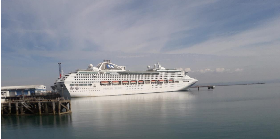
Sea Princess in Portland Port

Portland Port today welcomed another Princess – that is Princess Cruises ‘Sea Princess’, and this is not just any call but another inaugural call.